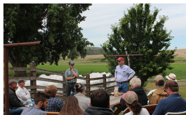
Palouse Colony Farm